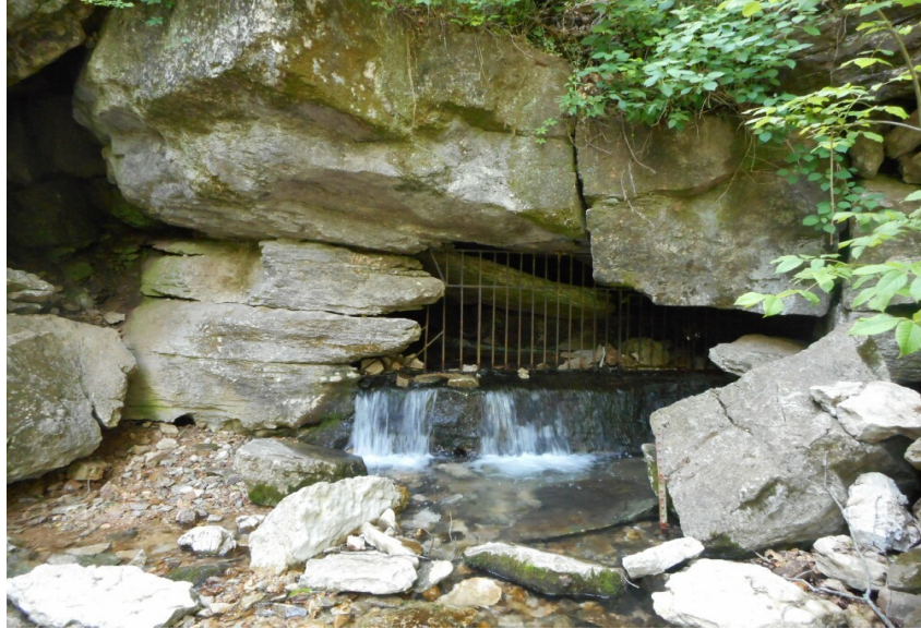
Blowing Springs as it looks today.