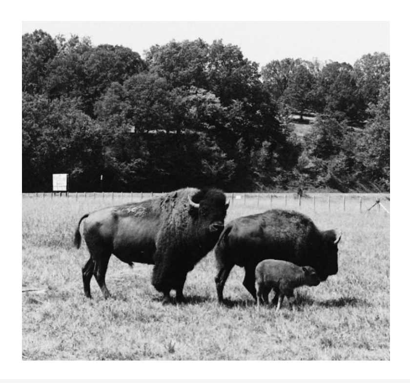
This picture of the buffalo was taken in 1970 right after the first baby, Sugar Creek Sue, was born.