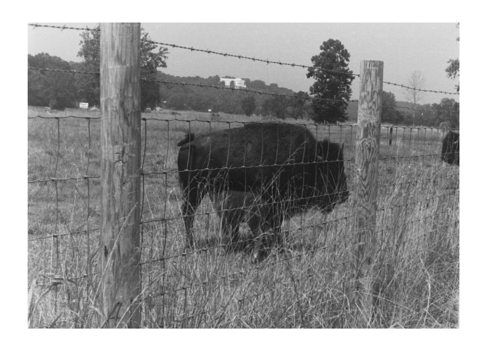
Village Hall (formerly known as the Sunset Hotel) stands up on the hill in the background of this 1970 picture taken of the new baby, Sugar Creek Sue, and her mother.