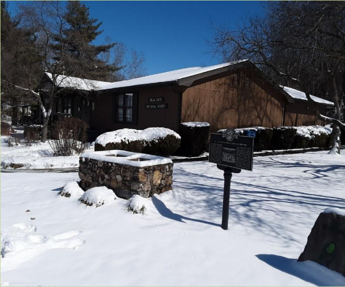
Museum grounds Feb. 20, 2025