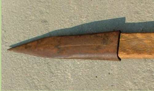
How a tobacco spear was used