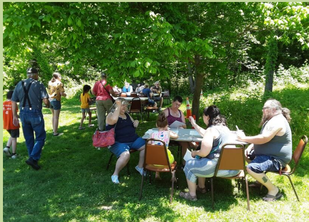
Tables were set up out back of the museum for food tasting.