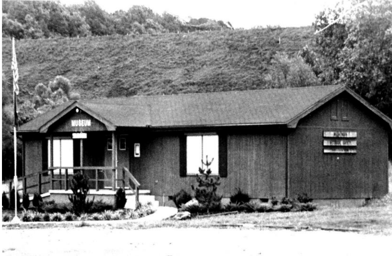
The Bella Vista Historical Museum as it looked in 1985.