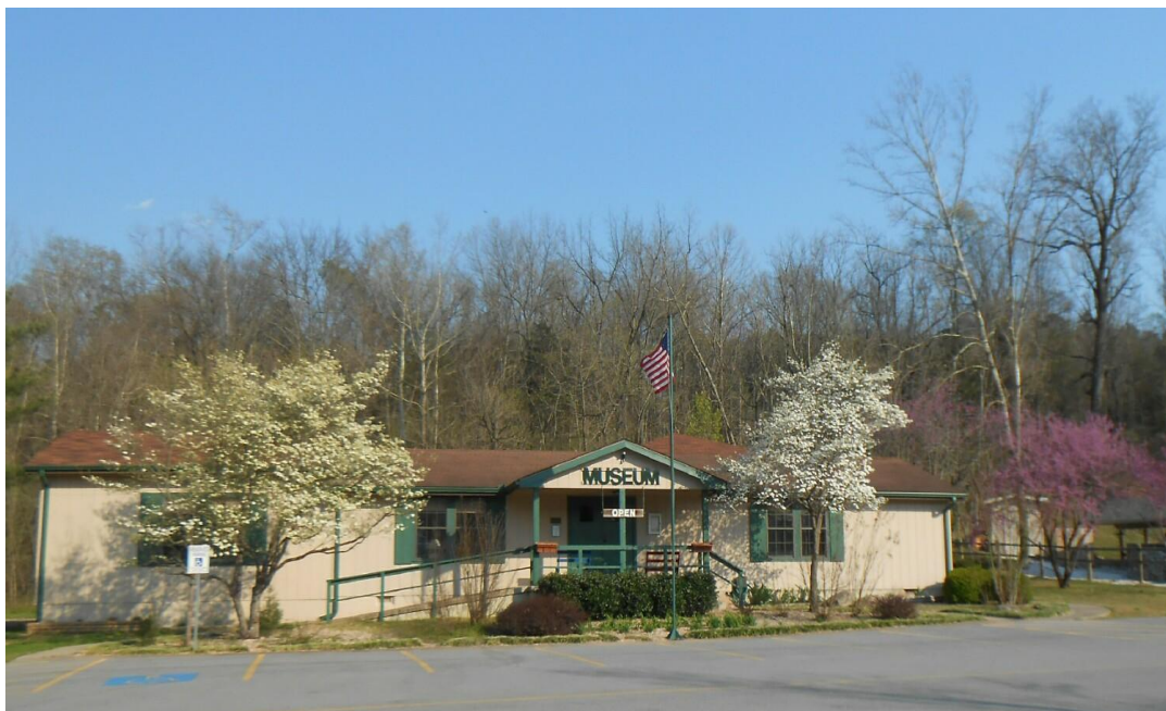
The Bella Vista Historical Museum as it looks in 2016.